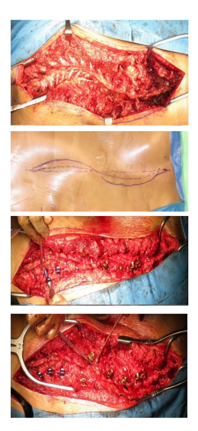
Figure 3. Surgical procedure step by step

*UEV: upper end vortex, LEV: lower end vortex