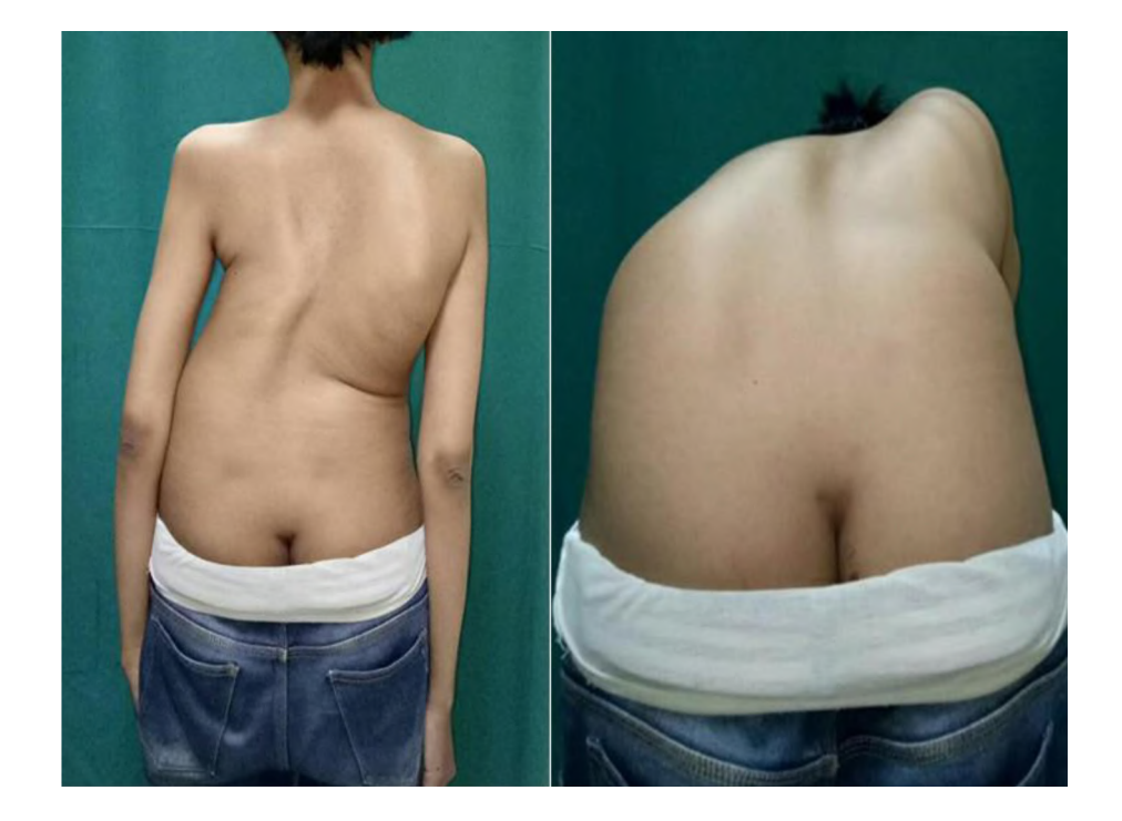
Figure 1. From the clinical picture, a curved back was present with right thoracic curve and left lumbar curve, with rib hump, no step off and no tenderness.