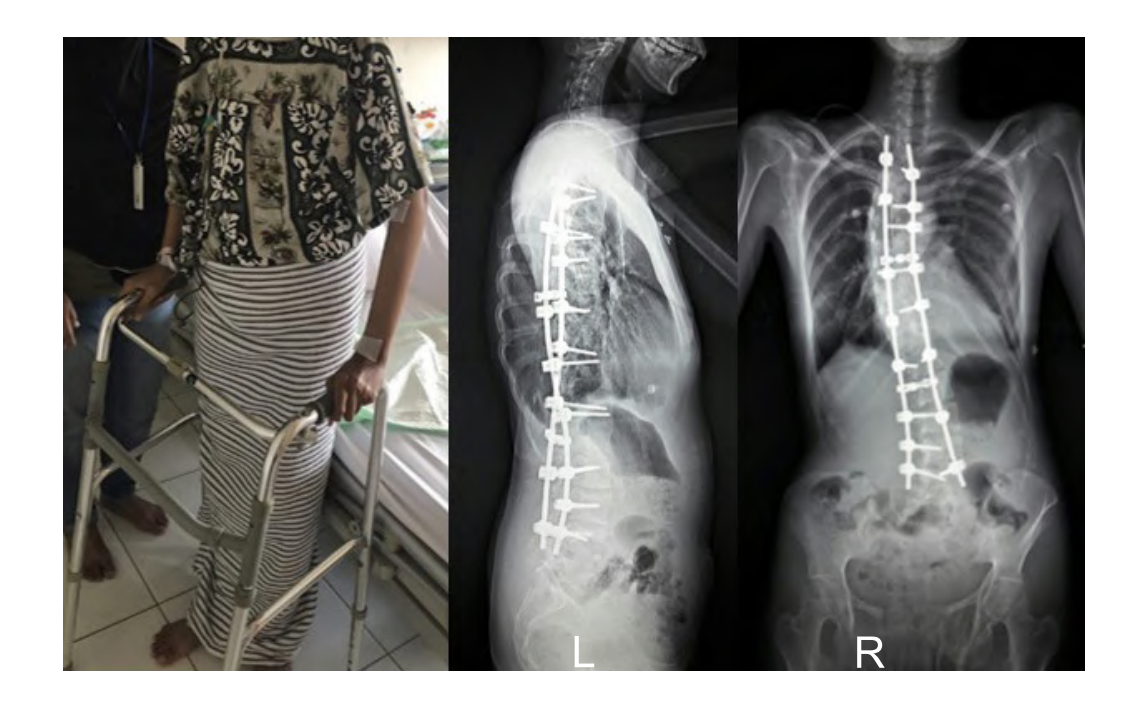
Figure 4. From left to right, clinical picture showing the patient had a good functional outcome, and the AP and lateral x-ray postoperatively.

Step 5. A rod is placed afterwards. Translational (the upper figure) and rotational (the lower figure) correction are done.